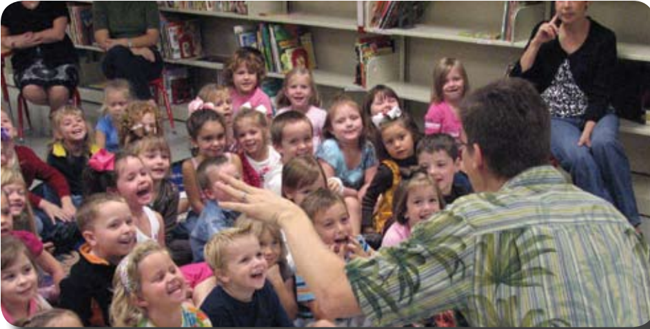
"Fun with the Singing Zoologist"