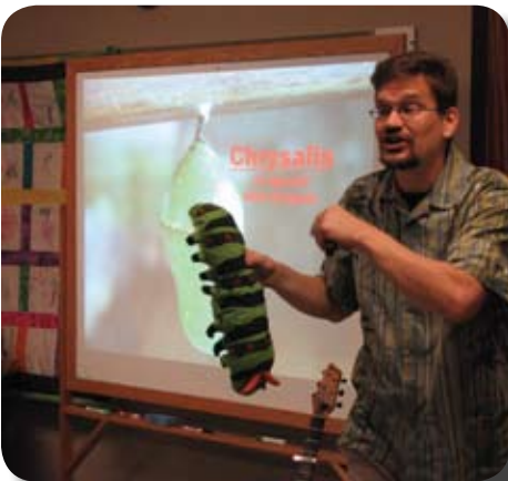
"The Singing Zoologist"