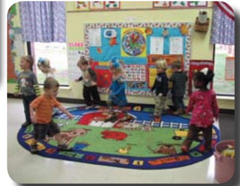
"Moving to the Music"