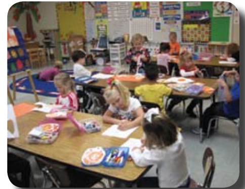
"Creating in the Classroom"